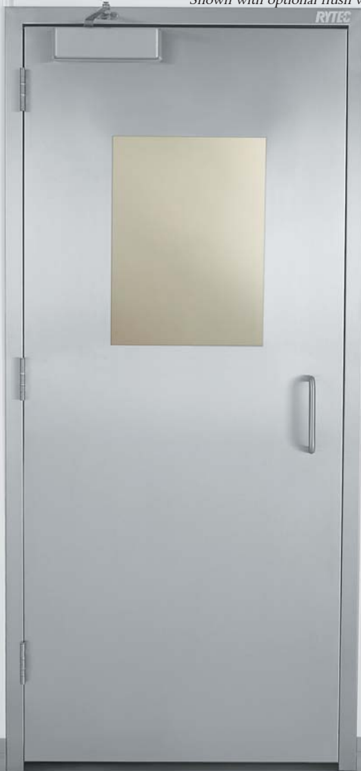
Shown with optional flush window and seamless frame.

The panels are fully seamless, 16 gauge 304 or 316 stainless steel, with 14 gauge reinforcing channels. Available in manual or powered versions, the Pharma-Swing SSS is engineered and manufactured to provide the clean lines and reliability required for uninterrupted facility operations.